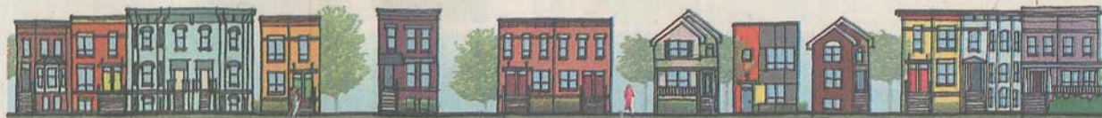
A composite photo from Landon Bone Baker Architects shows the 3100 block of West Walnut Street. The rendering depicts how the block will look with the addition of new buildings designed by the Chicago architecture firm for Hispanic Housing.