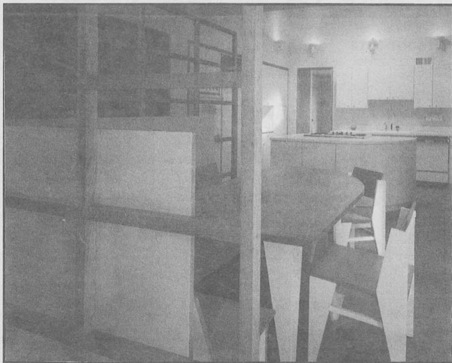
Architectural work and furniture of kitchen and eating area both by Peter Landon.

For those clients who remain skeptical or are short of